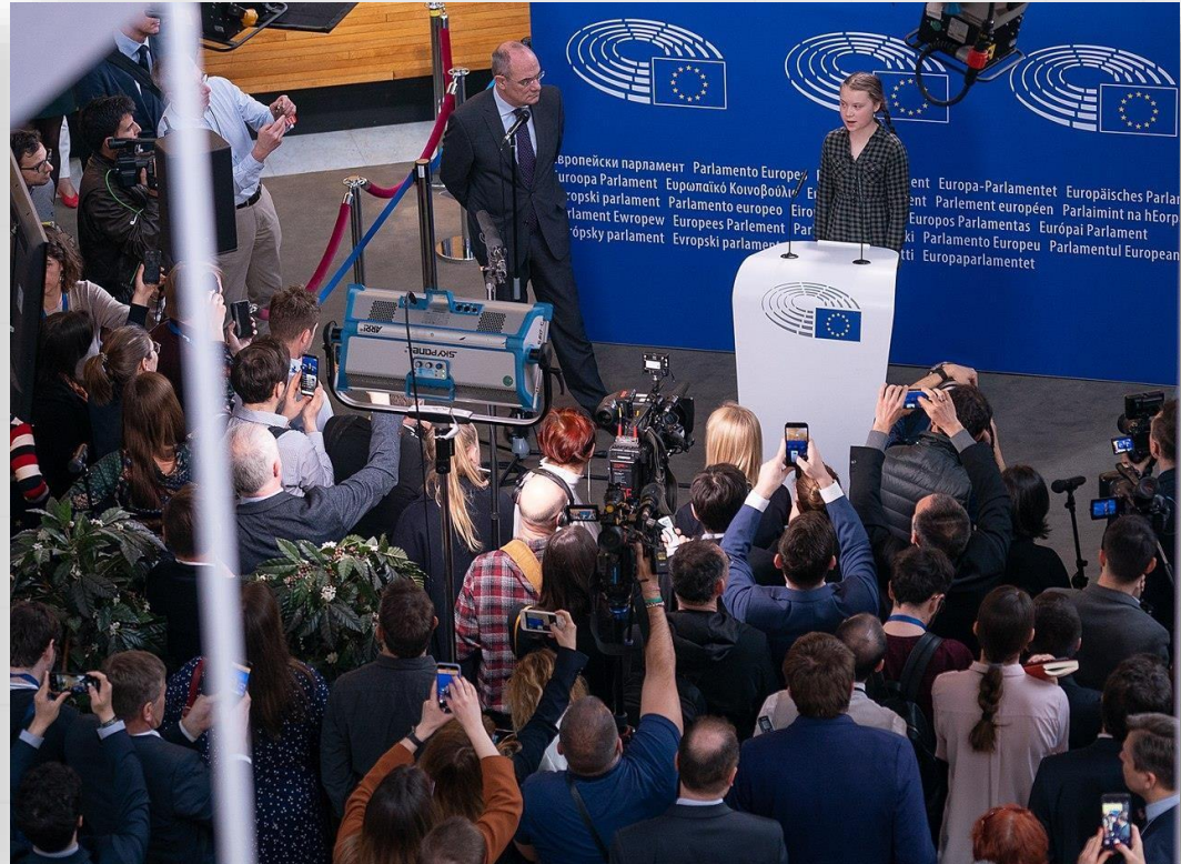
Greta Thunberg at the Parliament